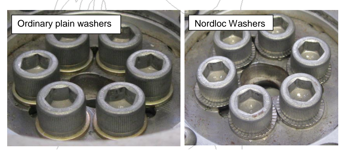
Figure 2 - Plain washers compared to Nordloc washers

When Nordloc washers are used on an aluminium surface a steel plate must be used to protect the aluminium surface. These are available from Jabiru.