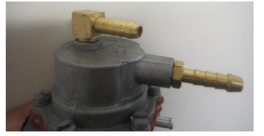
Figure 3: Pump with both fittings screwed in. (No further inspection required)